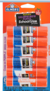
6 glue sticks