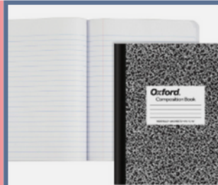
1 composition notebook 1 spiral notebook