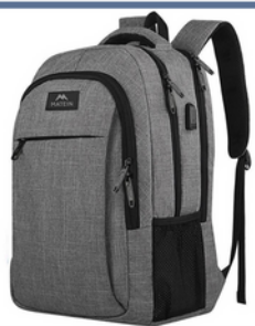
1 large backpack

Please bring these items with you to the supply drop off, labeled with your child's name.