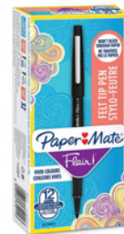
1 pack of black flair pens