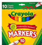
1 pack of 10 washable thin markers