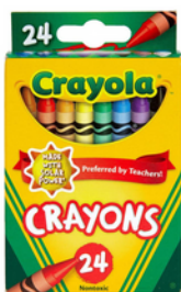
5 boxes of 24 regular crayons