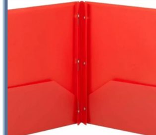
2 plastic pocket folders (1 red & 1 free choice)