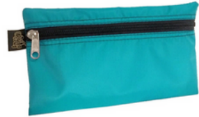
Pencil bag with zipper