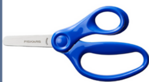
1 pair of scissors