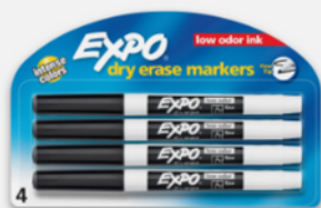
4 black fine tip dry erase markers