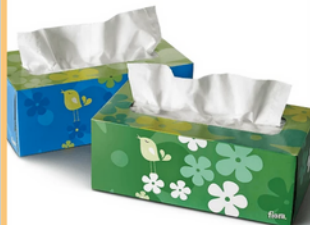
2 boxes of tissues