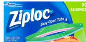
1 box gallon bags-boys 1 box sandwich bags-girls